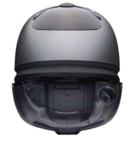
Small footprint to be easily packed into carry-on luggage