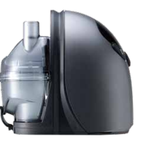
Easy assembly and disassembly of the water chamber with a simple hook and lock design