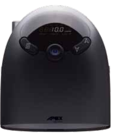
Clear backlit LCD display and intuitive user interface for easy operation